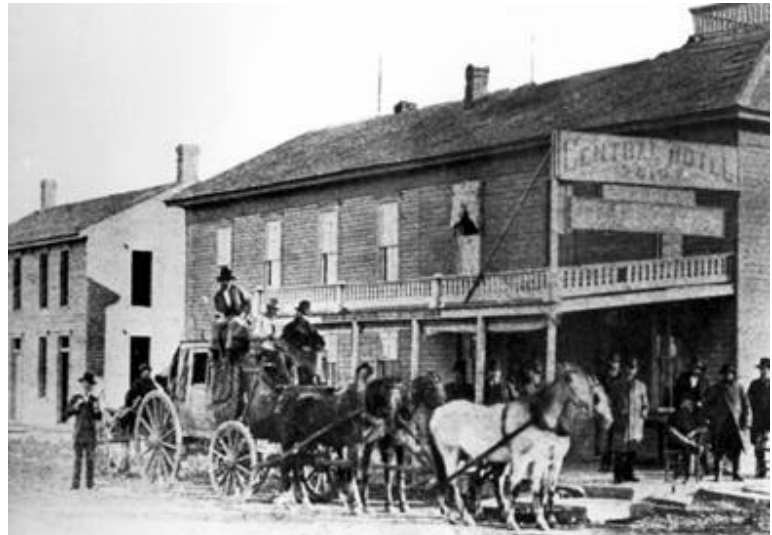
Stagecoach pulling into the Central Hotel in Winfield.